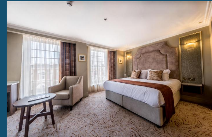
Walled City Hotel, Derry-Londonderry