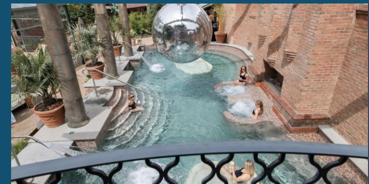
Rabbit Hotel and Retreat, Templepatrick