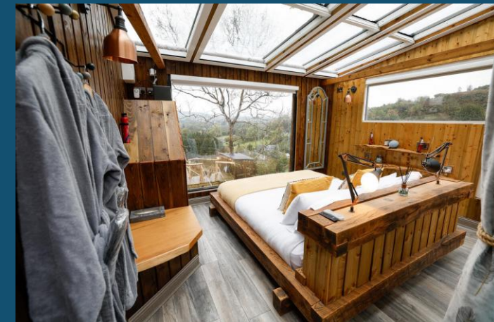
Balance Treehouse, Forkhill, Newry