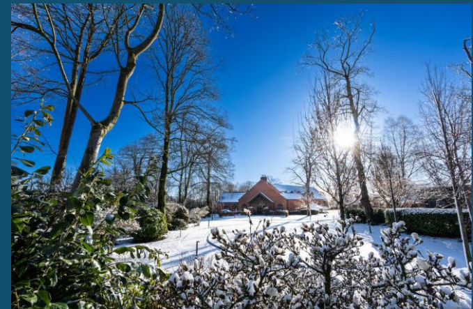
Clandeboye Lodge Hotel, Bangor