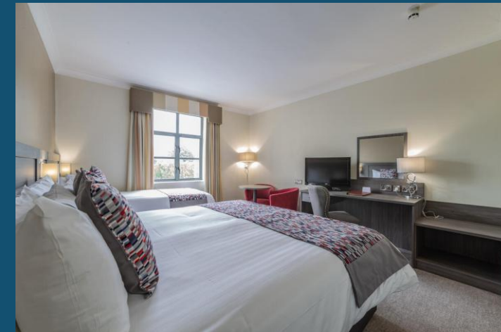
Armagh City Hotel