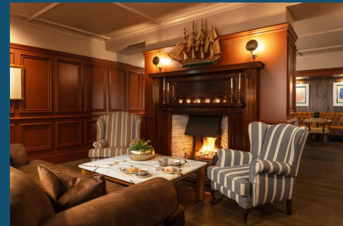
Harbourview Hotel, Carnlough

Mid & East Antrim has 7% of the available GH/GA/B&B rooms in NI and 4% of the available self-catering rooms.