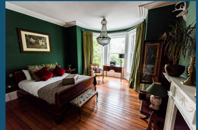
The Harrison Townhouse, Belfast