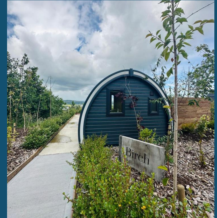
Arbor Hills Glamping Village, Islandmagee

Figures exclude school, university and college stock which offer accommodation, totalling 9 premises with 3,580 rooms and 3,984 bed-spaces