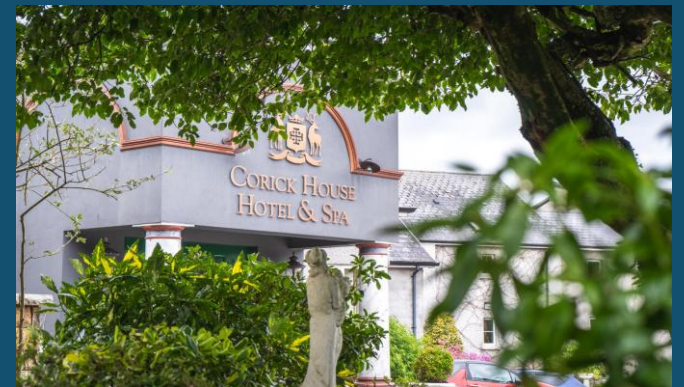
Corick House Hotel and Spa, Clogher