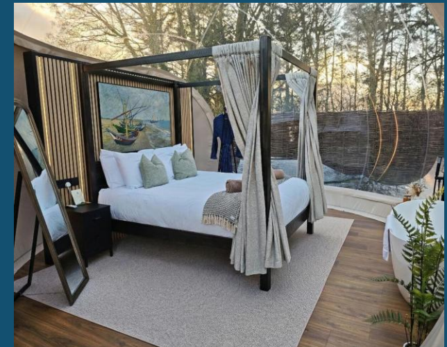
Cromore Retreat, Portstewart