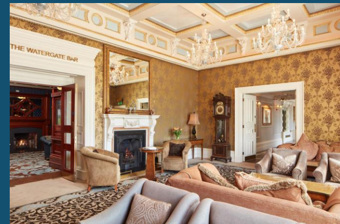
Manor House Country Hotel, Co. Fermanagh

4% of the available hotel rooms in NI are in Fermanagh & Omagh LGD.